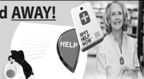
This Button SAVES Lives! As Shown GPS, Lowest Price Guaranteed!