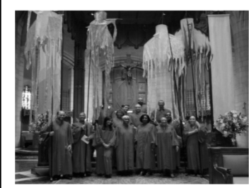
Tom Schmidt, Copyright © J. S. Paluch Co.

In the Gospel, Satan can be thought of as trying to get Jesus to do things the easy way. When he tempts Jesus to turn stones into bread, he shows Jesus an easy way to feed the people. But Jesus takes a better way, when he feeds us with himself in the Eucharist. The devil says Jesus can throw himself off the temple as a dramatic way to attract followers; Jesus lets himself hang from the cross to draw people to himself. Satan promises the kingdoms of the world if Jesus will only worship him. But Jesus chose to be crowned with thorns and receive his kingdom when he rose from the dead.